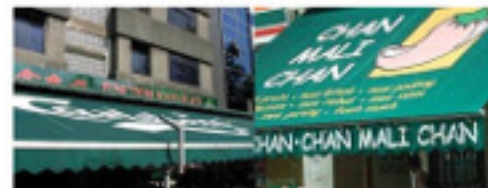
Trade Show Bunting