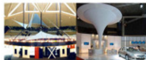
Outdoor Exhibition Displays

3 X Product photos, editing and listing Photos can be combined to include as much information as possible.